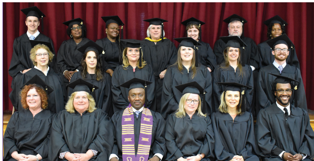
Graduates who participated in the 2018 Seminary Commencement Service.