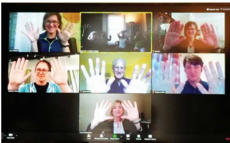
Local and distance Spiritual Direction students sign off each class by extending their hands and sharing the "blessing of the hands" with each other.