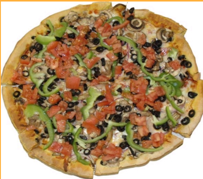
Table fellowship will start on THURSDAY Jan. 29 th , meeting at 4:30 and dining at 4:45 in the Saal. The night has changed with the hopes that we will have more at the table. The first night will be pizza.

Bring any ideas for themes and let's have fun!