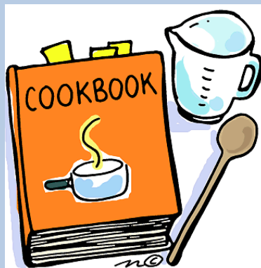
Table Fellowship Is Where It Is!

The recipes can be sent to Iris Lee at elluskott@gmail.com .