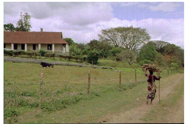
TANZANIA, Central Africa

Count Zinzendorf helped the Moravian Church rediscover its mission to the world after its near destruction in the 17<sup>th</sup> century. And 19 Provinces of people around the world came to be established. You can be a Moravian in many countries of the world in this unique international Church.