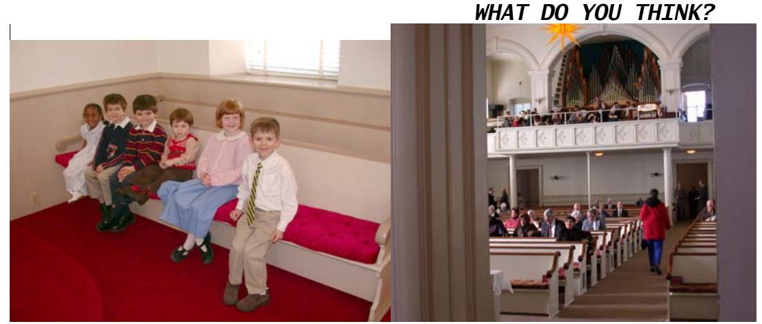
IN YOUR LIFE IS ONE OF THE MOST IMPORTANT PLACES I CAN BE.

(Though some of the materials and the photos are in color we tried to hold down the printing costs by keeping this in black and white.)